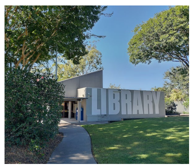
Coopers Plains Library.