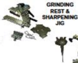
GRINDING REST & SHARPENING JIG

PROUDLY AUSTRALIAN MADE AND OWNED SINCE 1984