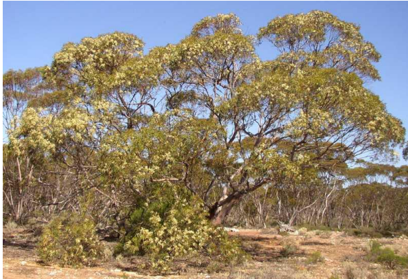
Red Mallee "Habit"

suitable for lumber, though they do have a propensity for burl growths that can be harvested and used for turning and other small specialty projects.