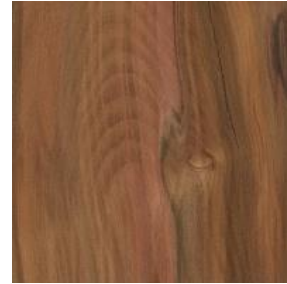
Red Mallee (sealed)

suitable for lumber, though they do have a propensity for burl growths that can be harvested and used for turning and other small specialty projects.