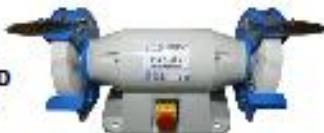
VICMARC SLOW SPEED GRINDER