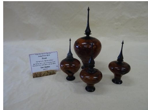
Red Mallee Lidded Containers by Ian Symes

Comments: The term mallee refers to a species' general growth form (known as a "habit" in biology). Usually smaller and shorter than trees, mallees grow multiple smaller-diameter stems from a common root system. Because of this, most mallee species are ill