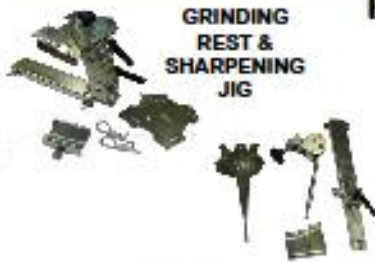
GRINDING REST & SHARPENING JIG

PROUDLY AUSTRALIAN MADE AND OWNED SINCE 1984